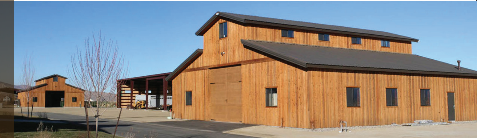
Frank Settelmeyer North, LLC Minden, Nevada Steve Mathews Construction, Builder

Future maintenance and energy cost considerations are a major concern and they receive major attention. Performance-proven quality materials used in manufacturing insure savings on future upkeep and maintenance. A Star building offers optimal efficiency and is termite and fire resistant. When it's time to expand, Star can provide the answers. Star building systems provide the flexibility to add on in an easy and attractive way.