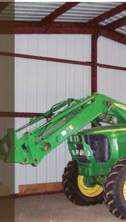
Perry Farms Wynnewood, Oklahoma Dansby Construction, Builder

...and provides energy efficiency and lower maintenance costs.