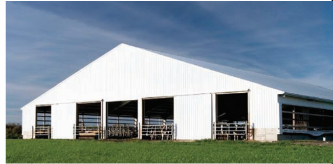
Dejong Dairy Lynden, Washington Faber Brothers Construction, Builder

Future maintenance and energy cost considerations are a major concern and they receive major attention. Performance-proven quality materials used in manufacturing insure savings on future upkeep and maintenance. A Star building offers optimal efficiency and is termite and fire resistant. When it's time to expand, Star can provide the answers. Star building systems provide the flexibility to add on in an easy and attractive way.